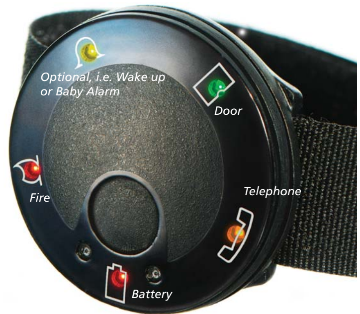
Lynx MiniVib. Your perfect awareness companion.

Easy to use: The MiniVib is simple to use and the lighted diodes are clearly visible. When you put the MiniVib in night-time mode, all alert modes except the fire and wake up alarms are disabled. The unit operates on rechargeable batteries.