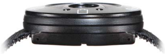
Five clear symbols.

We are now proud to present the innovative Lynx MiniVib. The MiniVib is a discreet, wireless alert indicator that can be worn on your wrist, arm or ankle, keeping you well aware of various events around you.